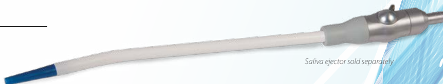
Saliva ejector sold separately

B10161 Sterile Aspirator Tip (Box of 20)