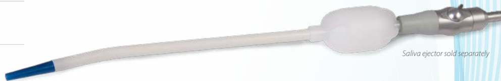
Saliva ejector sold separately

B10160 Box Contains: 10 sterile packages that includes an aspirator tip with a collector and two removable filters (Box of 10)