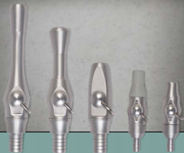
Long HVE Medium HVE Short HVE SS S.E. S.E.

Now that you can sterilize your suction handpieces after each patient... why take any chances?